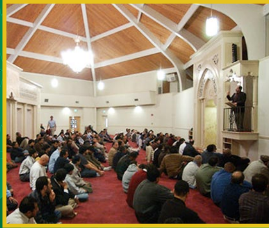
Masjid • Community Center • School

Masjid in the heart of Alabama is Expanding