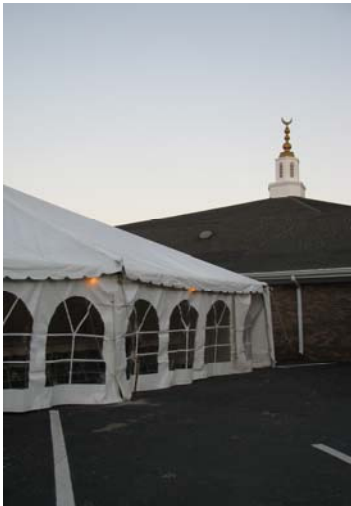
Hoover Crescent Fundraising Dinner. Dinner was served outside in a tent.