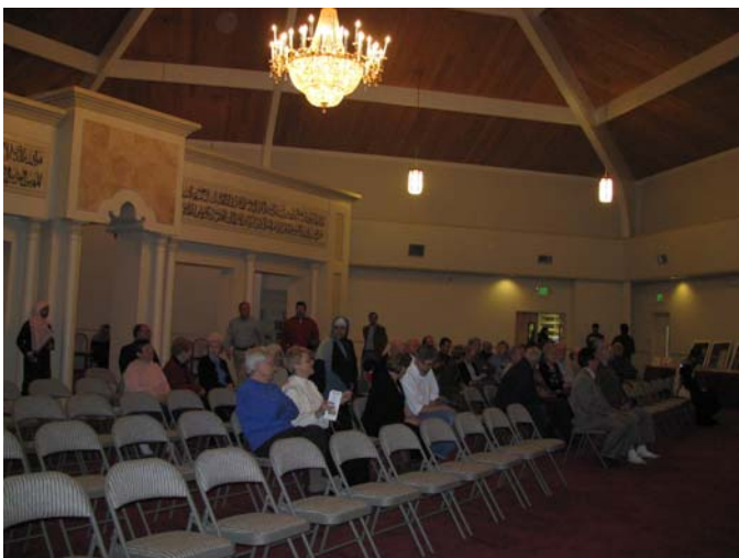
Program set-up in the prayer area.