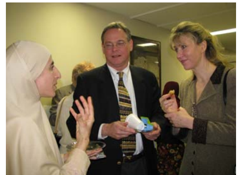
Engaged in thoughtful conversation!

Overall, the event was successful and ran very smoothly, alhamdulillah. It was exciting to see the Hoover Crescent Islamic Center vibrant and bustling with activity. Several guests felt welcomed and enjoyed the experience of visiting a Masjid for the first time in their lives. They appreciated our efforts and were curious to find out more about Islam and who Muslims really are. We pray that at least one person left the Open House with a better understanding of who we are and what are beliefs are. May Allah (subhana wa ta'ala) reward everyone who played a role in this important event. ■