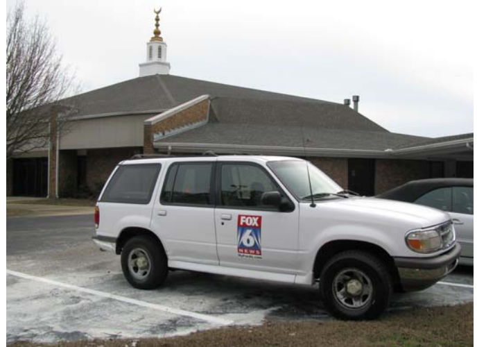
Fox 6 on the scene for the Open House!